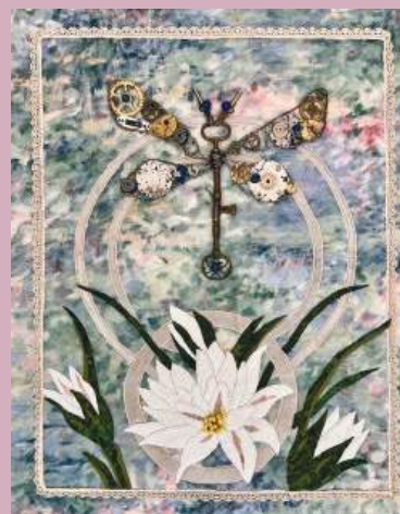
Sweet Dragonfly, Carole Price