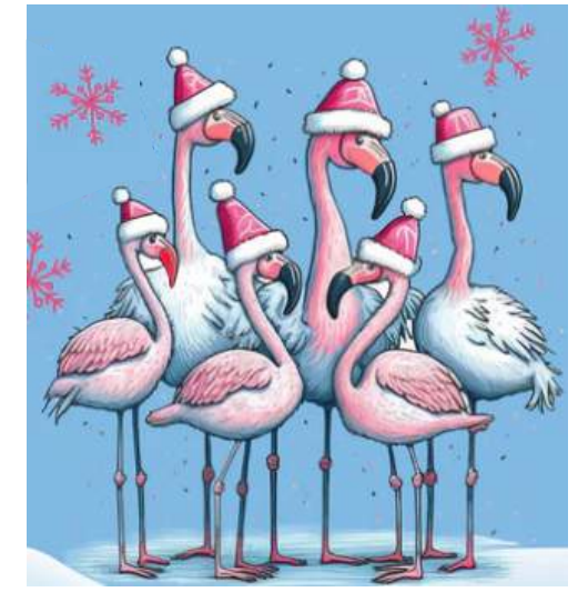
RSVP on our website