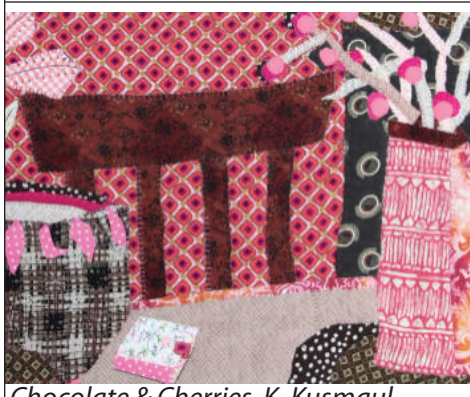
Chocolate & Cherries, K. Kusmaul