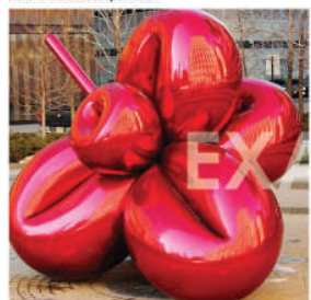
Jeff Koons inspiration