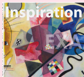
Wassily Kandinsky Inspiration