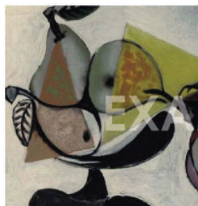
Pablo Picasso inspiration