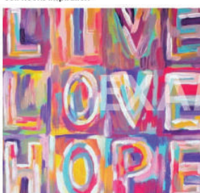
Jasper Johns inspiration